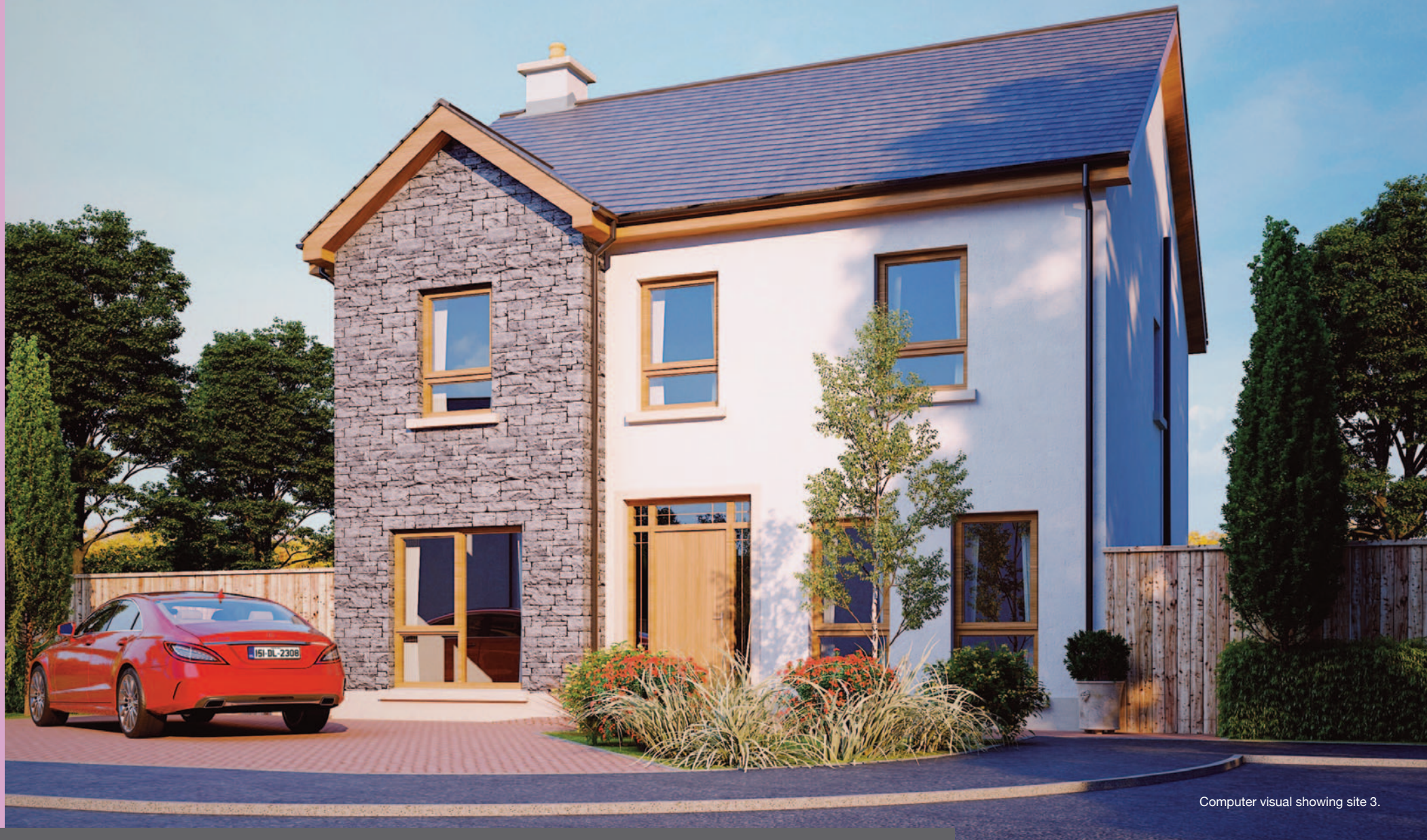
Computer visual showing site 3.