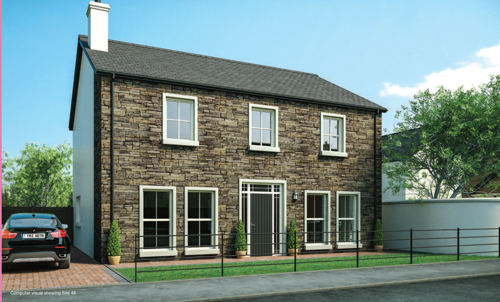
Computer visual showing Site 48