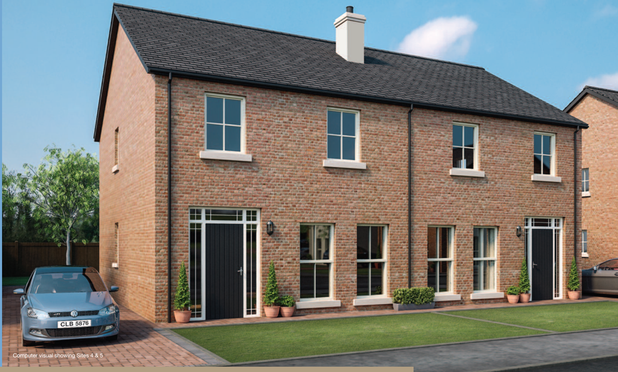
Computer visual showing Sites 4 & 5